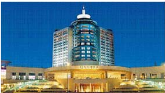
CONRAD HOTEL, PUNTA DEL ESTE

THEME: PRIORITIES IN PROFESSIONAL PRACTICE: FOR WHOM ARE YOU WORKING?