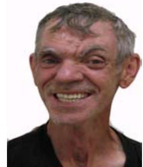
Extreme Makeover: Mission Edition