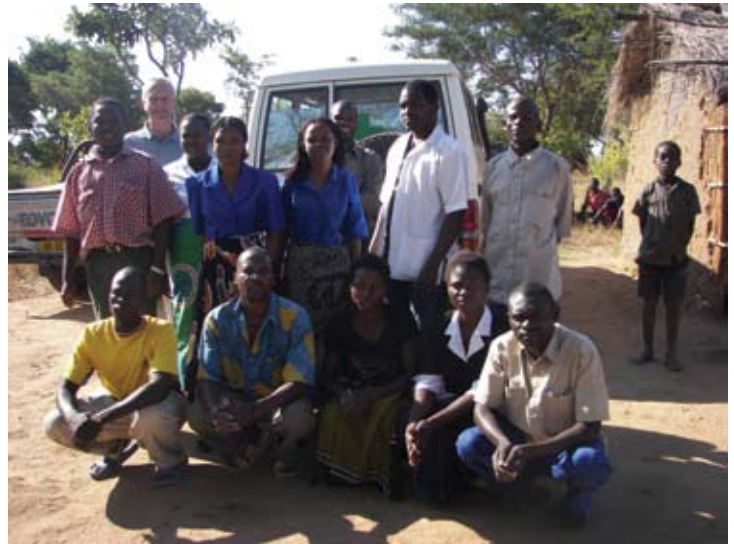
The very first clinic of Lifeline Malawi was held under a baobab tree and conducted from the back of my ancient pick-up truck